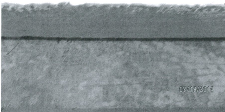
Figure 2 - Detail of the test specimen.